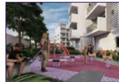
CHILDREN'S PLAY AREA-2