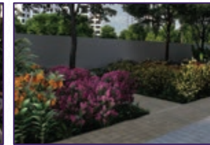
FLORAL AND HERBAL GARDEN