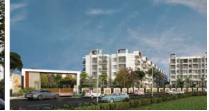
Abhee Silicon Shine (Phase-2) Sarjapura Road, Opp. Wipro Sez 1, 2 & 3 Bhk Luxury apartments