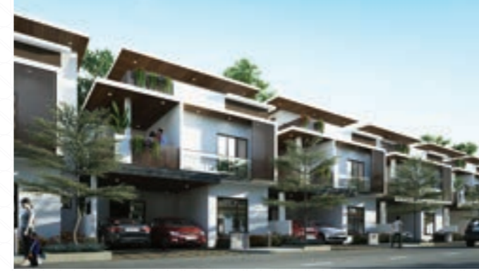
Abhee Prakruthi Villa Chandapura, ( Near Suryacity Phase -1 ) 3 & 4 Bhk Luxury Villas