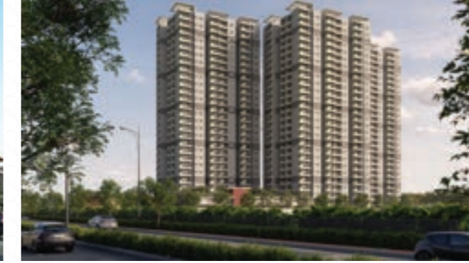
Abhee Celestial City Chikkavaderapura Village, Gunjur 2, 2.5 & 3 Bhk Luxury apartments