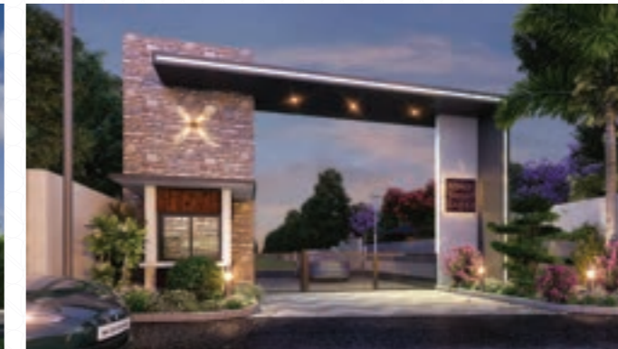
Abhee Sashti Layout, 30'x40', 30'x50' & 40'x60' Ready to Register and Construct