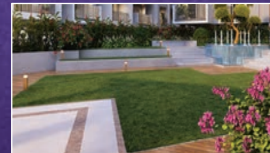
MULTI-PURPOSE PLAY COURT