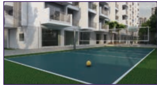
MULTI - PURPOSE PLAY COURT