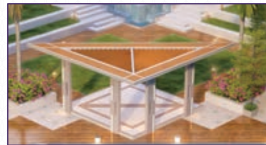
STAGE/ DANCE PLATFORM