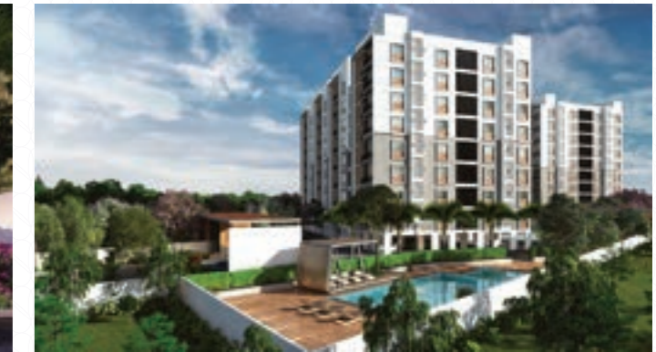
Abhee Kings Court Sarjapur road, Chembenalli 2 & 3 Bhk Luxury apartments