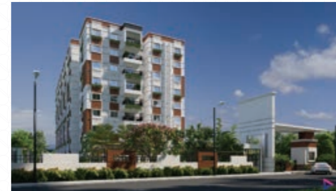
Abhee Pnde Chandapura, ( Near E-city ) 2 & 3 Bhk Luxury apartments