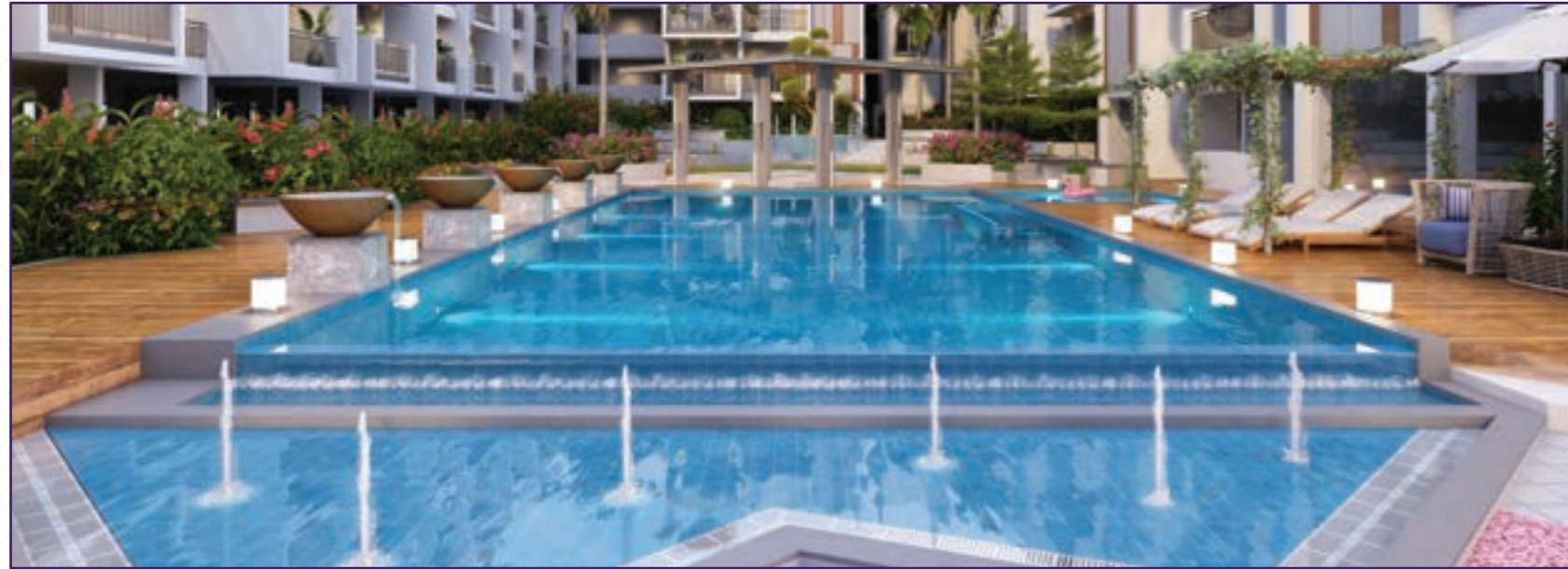
KIDS AND ADULTS SWIMMING POOL

Unwind by the adults' pool, letting cool water wash away your worries. For the little ones, our dedicated children's pool with playful features promises endless aquatic adventures. Riviera Royale caters to all ages, making poolside fun a family affair. Choose to create memories together that you can cherish lifelong.